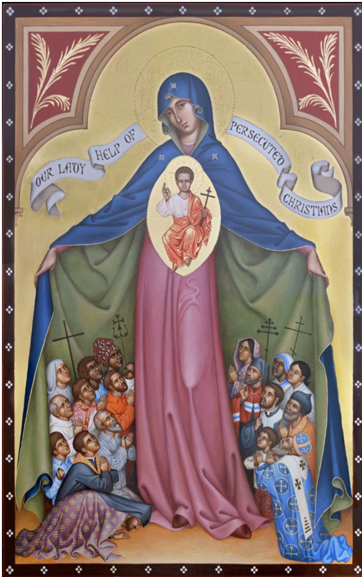
Our Lady, Help of Persecuted Christians icon

Spread devotion to Our Lady and pray for our brothers and sisters of faith who are at risk around the world through the Marian Prayer Program. As the new Marian image is brought on pilgrimage through the jurisdiction, councils will host the Our Lady Help of Persecuted Christians icon for a prayer service at their parish.