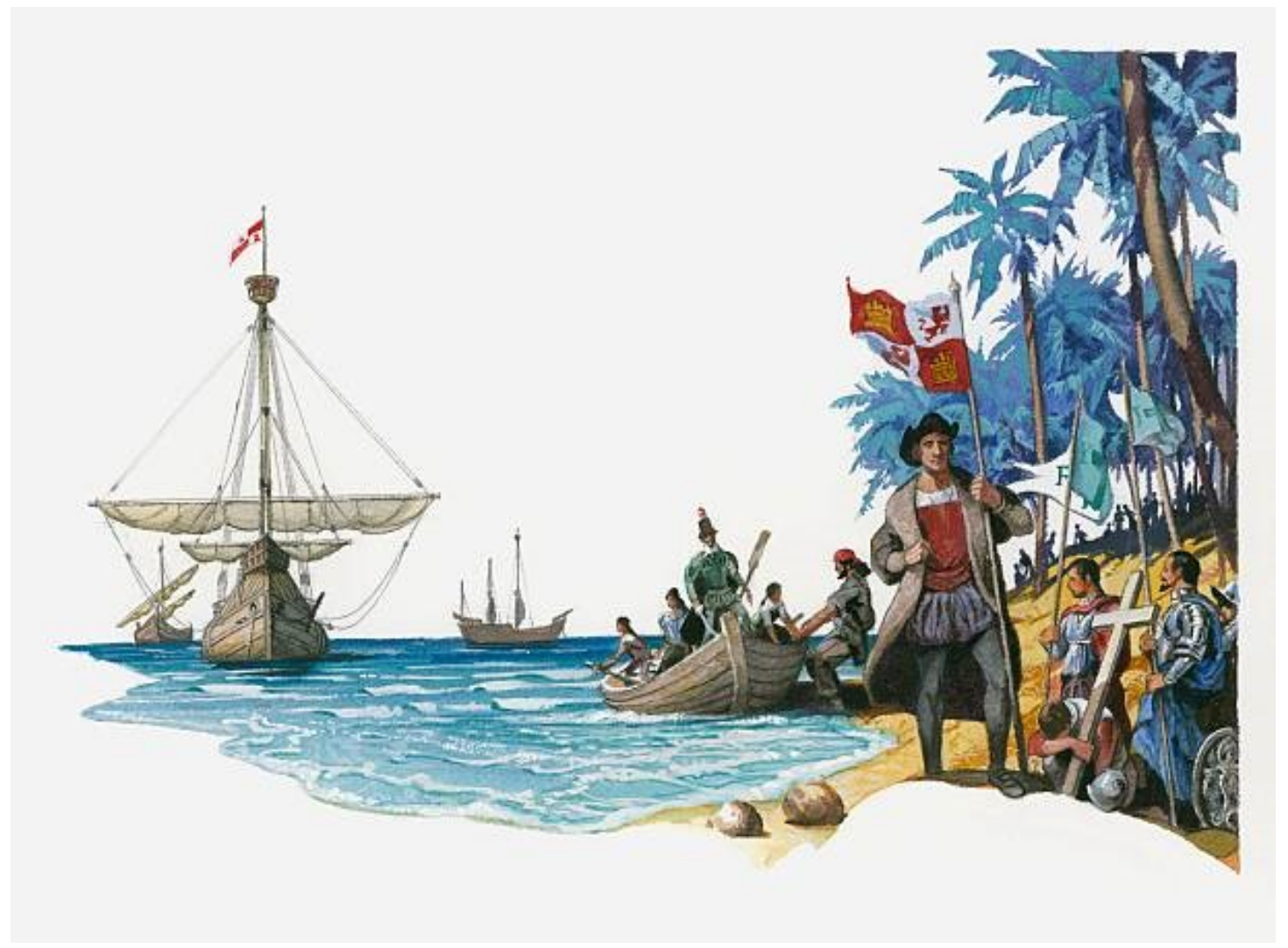
Christopher Columbus lands in the West Indies (America) in 1492